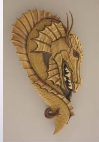
Too little light makes the photo appear flat.

For the most part, cameras have difficulty focusing on a subject when you are very close to it, or using the zoom function too much. If pulling back a little bit doesn't help the camera focus on the entire subject, hold a $1 bill in the center of the project—where you want the camera to focus—until the camera's auto focus locks in. Remove the bill and snap the photo.