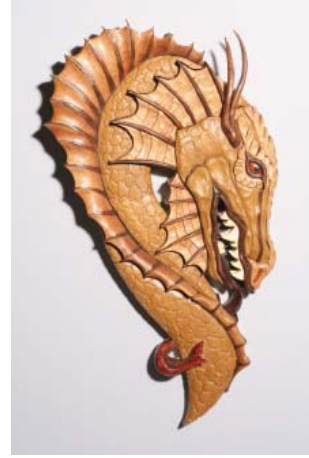
The glare off the glossy finish of this project is distracting and hides the details.