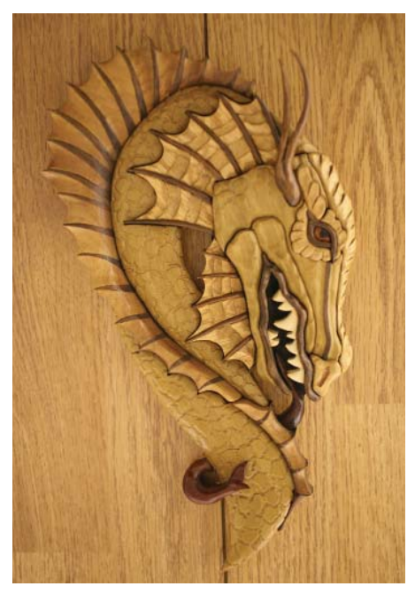
A busy background or one of similar texture and tone can totally upstage the subject of a photograph.