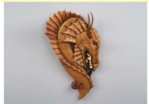
If your project is tall and thin, take a vertical photo. Both these photos are 5 x 7s, but the horizontal orientation sacrifices the size of the subject because much of the image is wasted on the background.

Most computers show the size of a photo in pixels. For most publications, your photo needs to be at least 1200 x 1500 pixels. For a 5" x 7" photo to be reproduced properly in the magazine, you need at least a 3 mega-pixel camera, but a 4 mega pixel to 5 mega pixel camera is